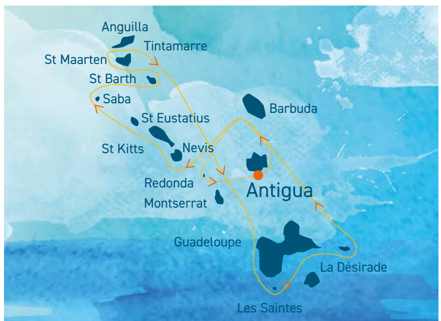
Figure 1 - The Course

It will be mandatory for boats to carry an Offshore Tracker unit for the RORC Caribbean 600 Race. The units are standalone and will be supplied by the RORC. The entry fee includes tracking. Once issued to the boat the Tracker becomes the responsibility of the skipper/owner and loss of or failure to return the tracker will be charged at £800.