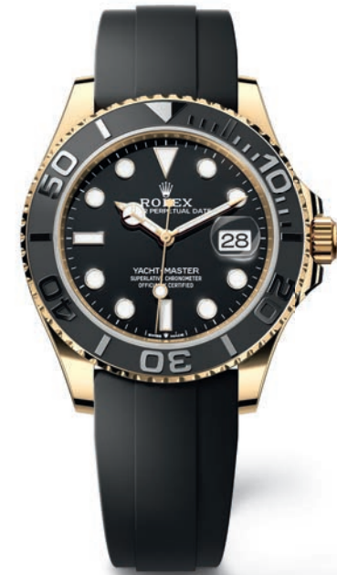
OYSTER PERPETUAL YACHT-MASTER 42