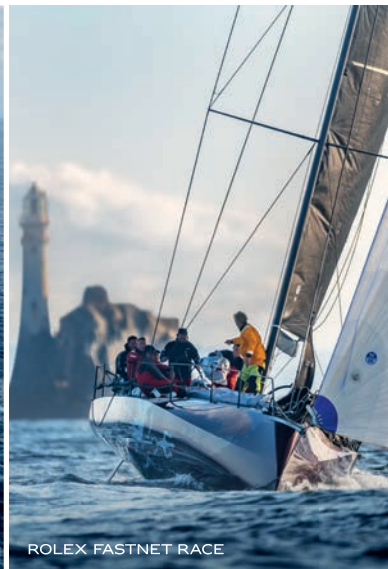
ROLEX FASTNET RACE