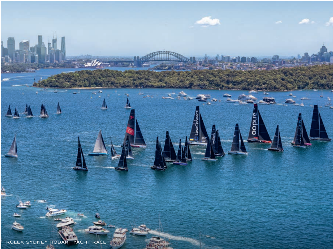
ROLEX SYDNEY HOBART YACHT RACE