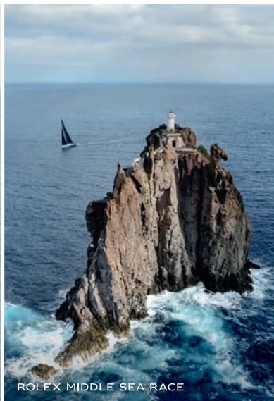
ROLEX MIDDLE SEA RACE