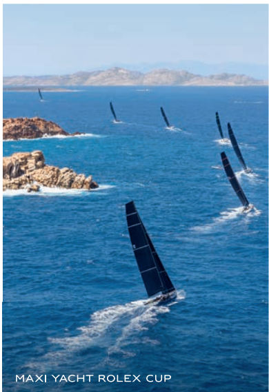
MAXI YACHT ROLEX CUP